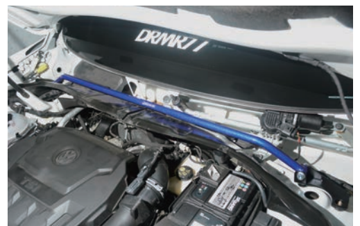
Illustration of installed state 安裝完成示意圖