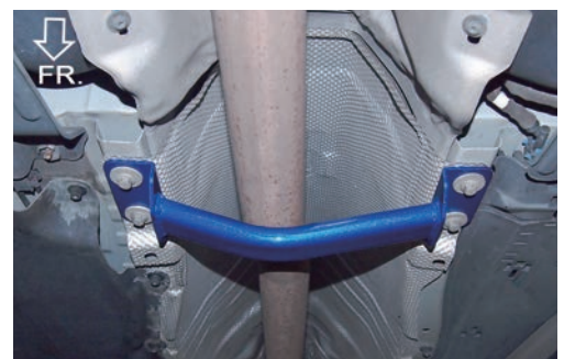
Illustration of installed state 完成示意圖